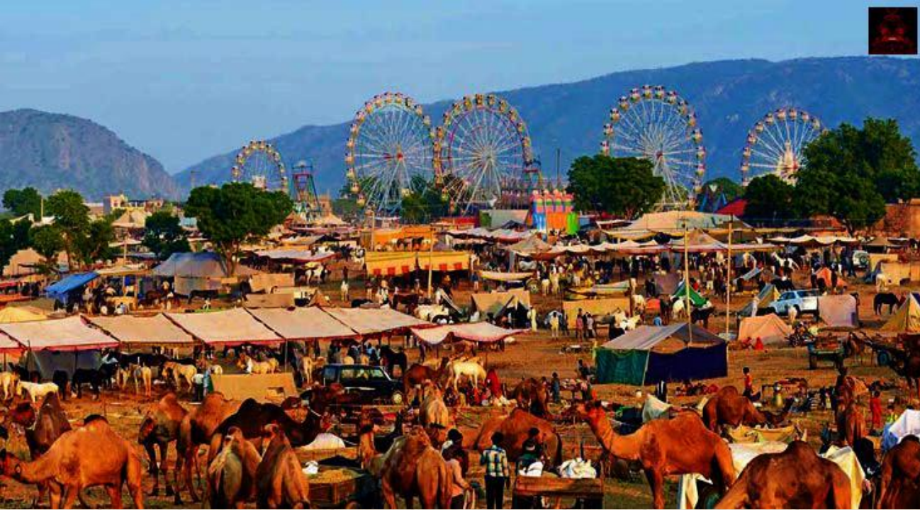
□ PUSKAR FAIR