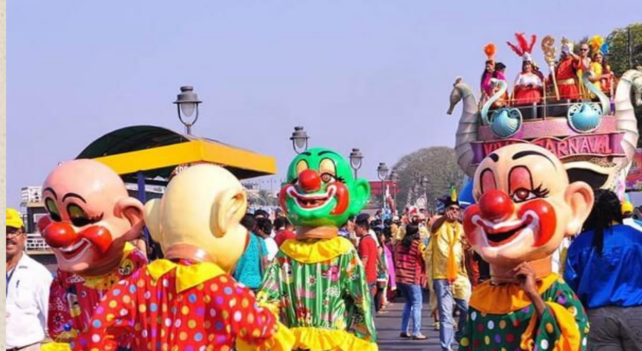
□ GOA CARNIVAL