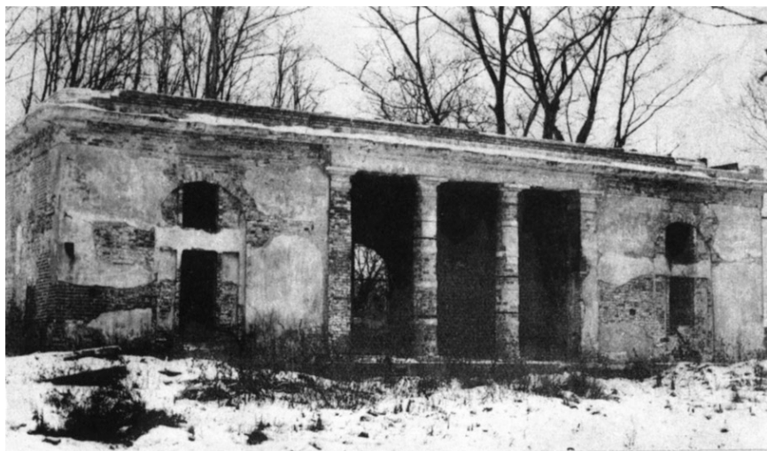
Южный корпус служб

Over seven decades of neglect the world of Russia’s country estate and its evidences were clearly on the verge of vanishing despite experts’ and activists’ concerns and appeals to preserve those sites that still existed and restore those desolated and already partially lost.