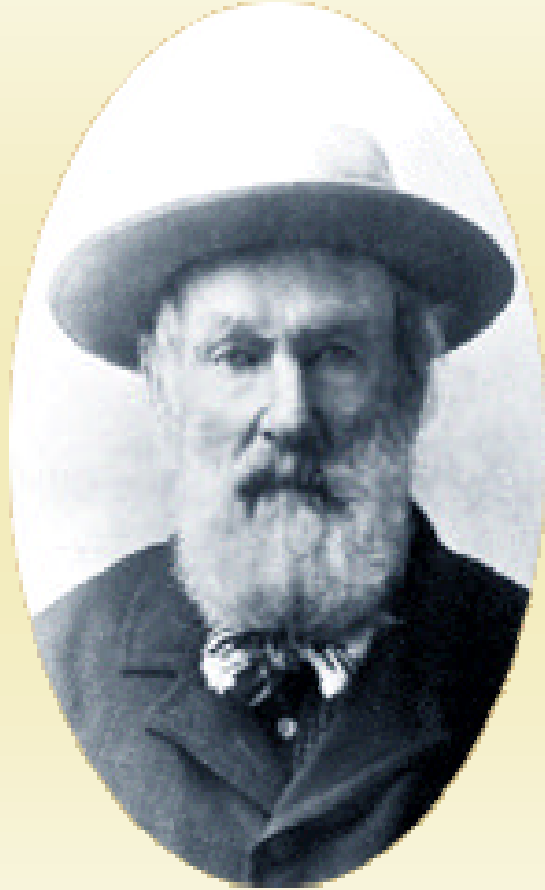
Billy Barker struck gold in 1862